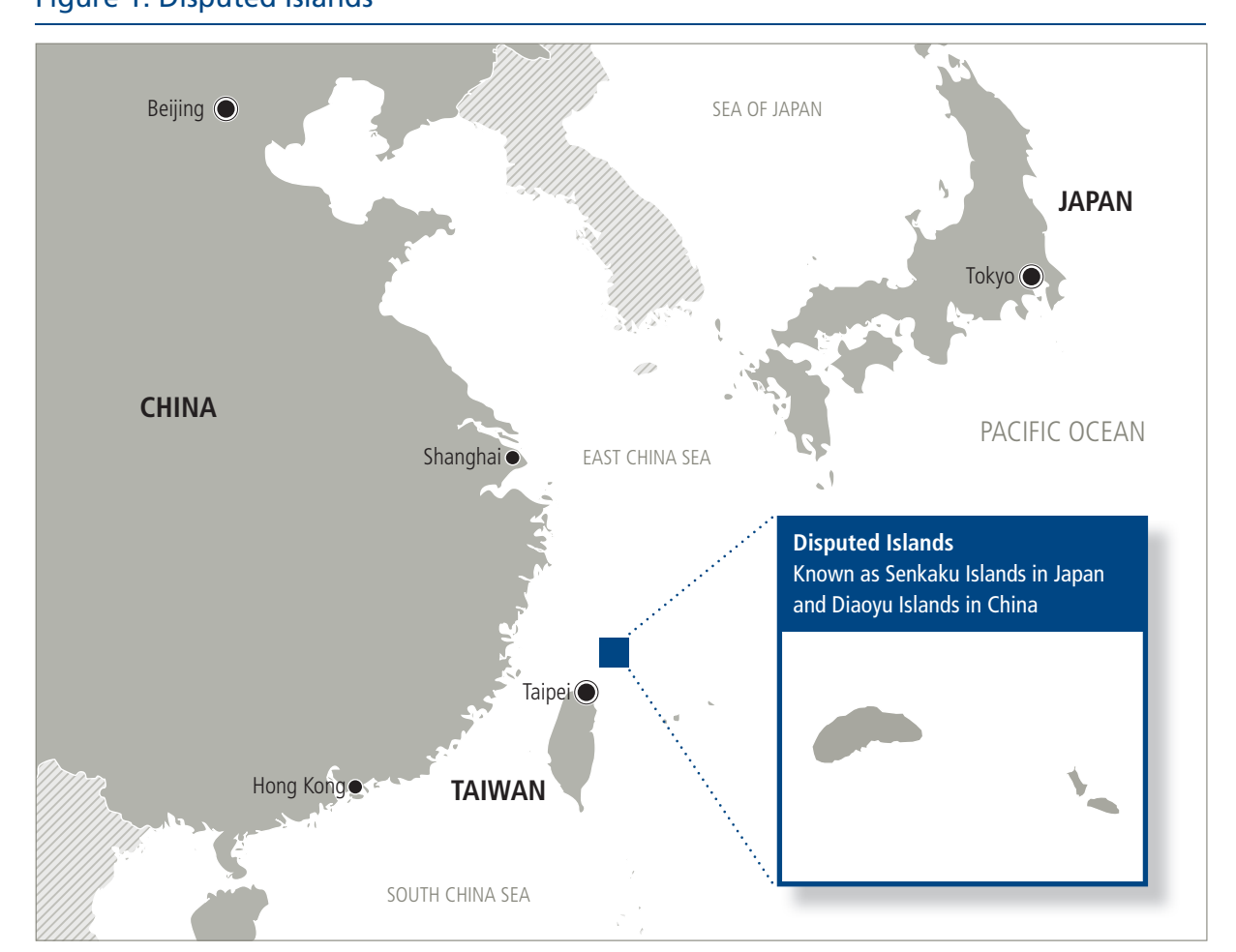
Figure 1: Disputed Islands

Article 3 of the San Francisco Peace Treaty then put the disputed islands under the administration of the Unit-