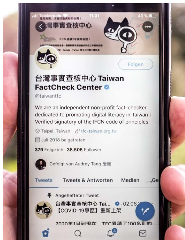
Twitter account of the Taiwan FactCheck Centre

Takeaways and challenges for Europe: In Taiwan, school children are regarded as active members of society that have a say and that can positively influence their society. In many European systems, students are still treated as passive consumers of knowledge. Social and political competences often play a minor- to no role in European curricula. Taiwan shows that the early and active education of media and societal competences has great benefits, as students become less prone to fake news and start to feel as real citizens from an early age on.