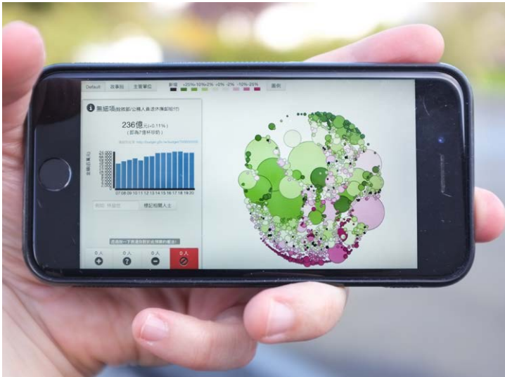
Website of the Citizens' audit system on the governments' central budget, Taiwan