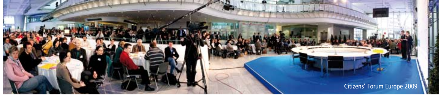
Citizens' Forum Europe 2009